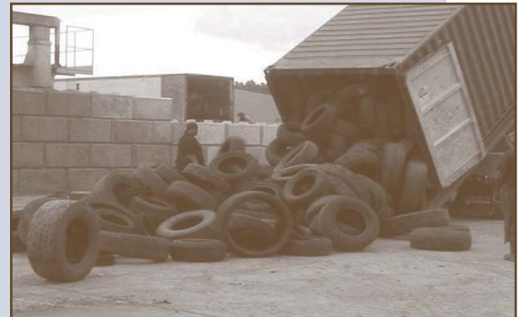
Scrap tires are collected at a tire recycling center and sent to a special plant that shreds waste tires into small strips, removing all metal and steel bits.