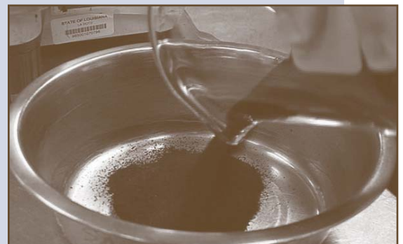
Tire strips are then ground into sand-sized particles, creating crumb rubber.